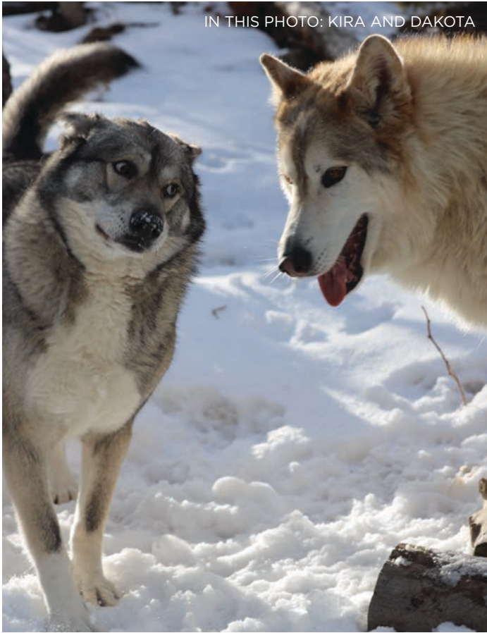
IN THIS PHOTO: KIRA AND DAKOTA