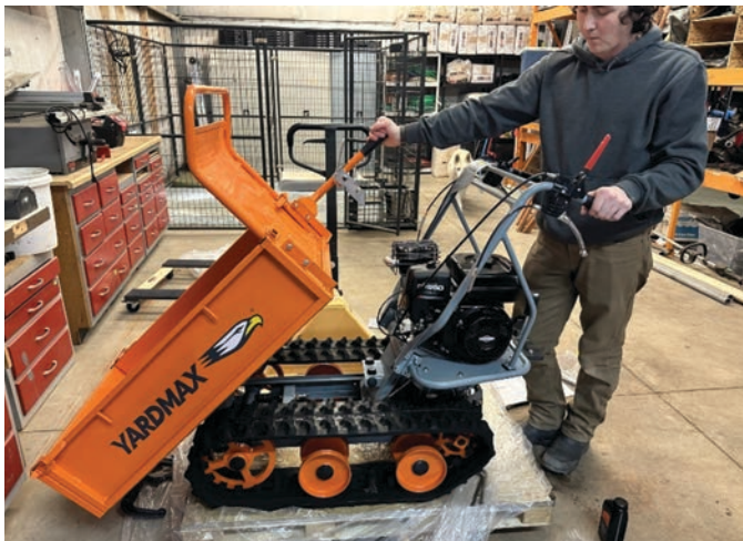
New Yardmax TrackBarrow