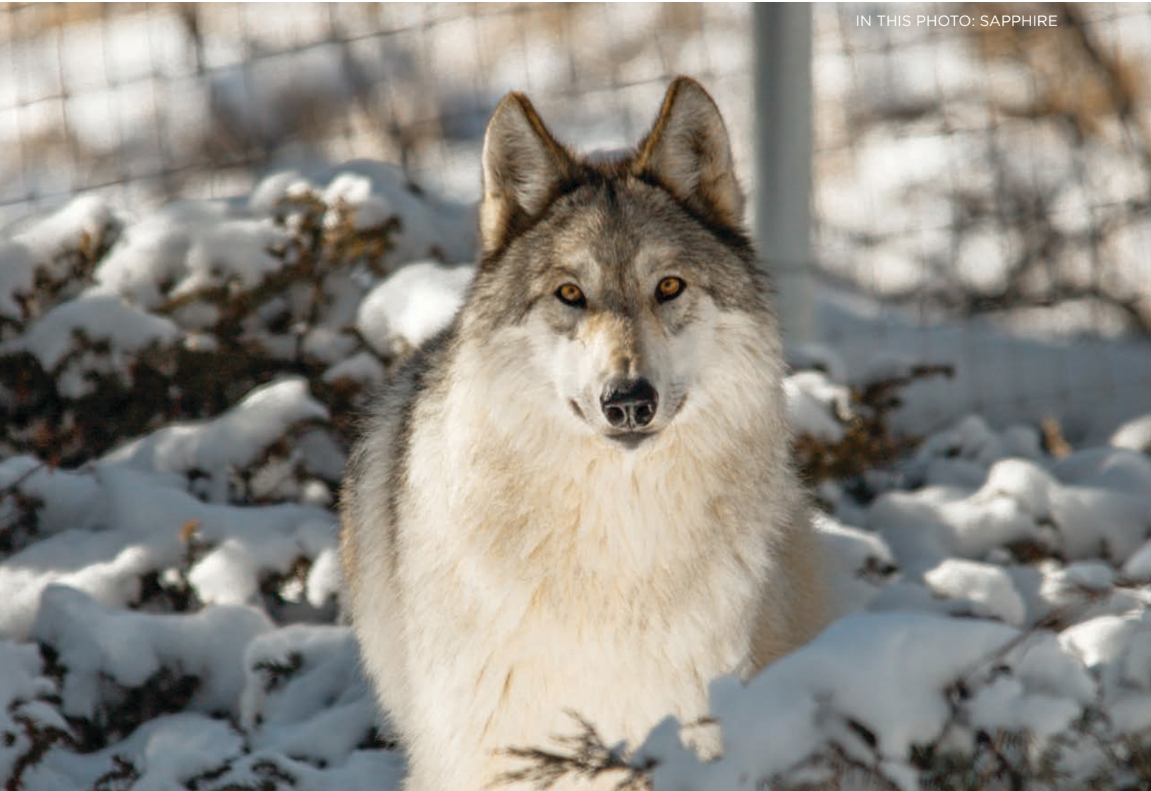
IN THIS PHOTO: SAPPHIRE

Since completing the move to Red Feather Lakes, W.O.L.F. Sanctuary staff and volunteers continue to marvel at how happy the animals are with their new surroundings. It is rewarding to see them continue exploring their new habitats and all the natural features, like rock outcroppings, that the habitats offer. Ashima has even constructed her own den!