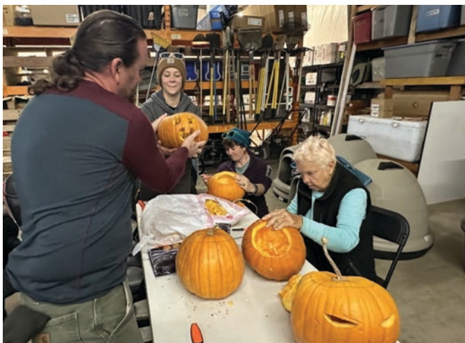
Larimer County Department of Natural Resources Volunteers carving pumpkins

Additionally, thanks to a generous donation, we were able to purchase a powered track barrow that allows us to move heavy materials and sometimes food in the rough terrain at W.O.L.F. This piece of equipment will be invaluable with the tasks planned for spring.