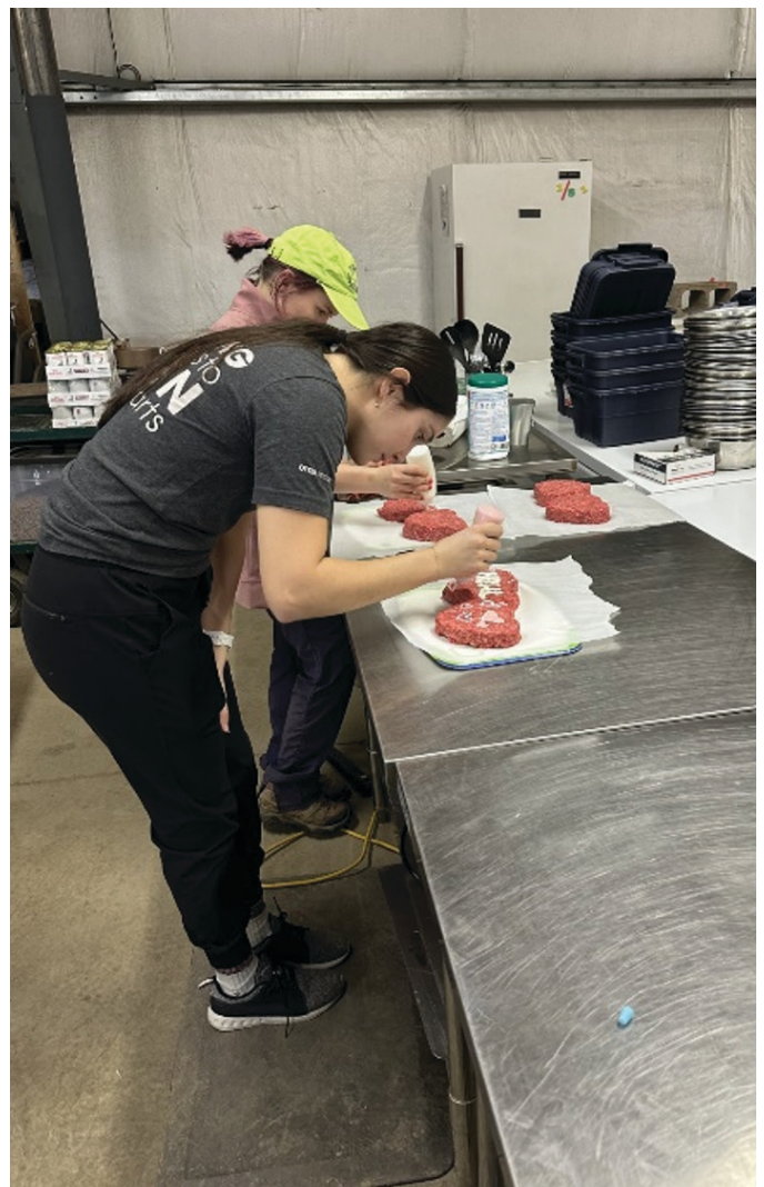
Otterbox Volunteers and W.O.L.F. Staff making Valentine's hearts