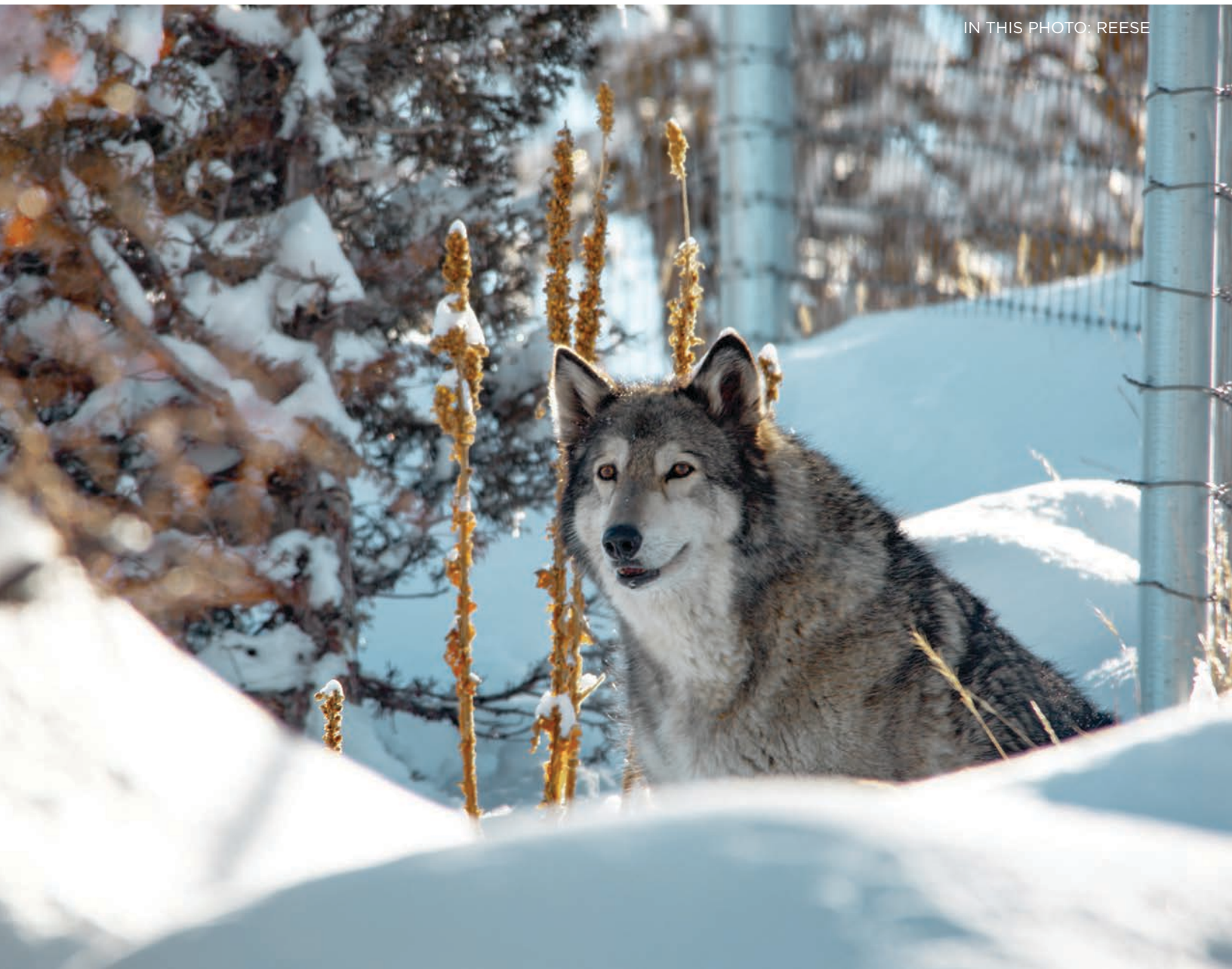
IN THIS PHOTO: REESE