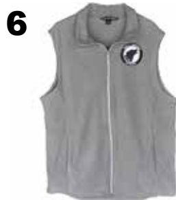
Logo Fleece Vest Sizes: S - 2XL Price: $45.00