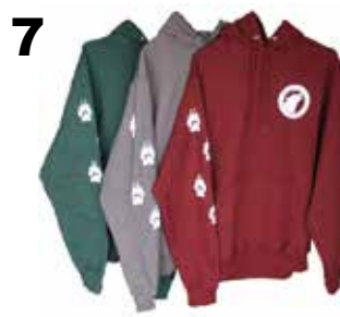
Logo Pullover Hoodie Sizes: S - 3XL Price: $37.00