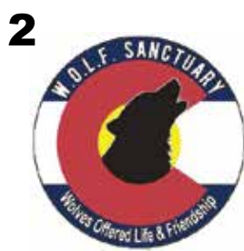
Colorado W.O.L.F. Sticker Price: $5.00*