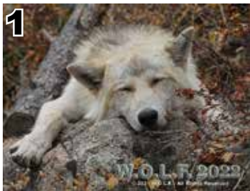
2022 W.O.L.F. Calendar Price: $15.00*