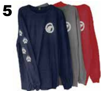
Logo Unisex Long Sleeve T Sizes: S - 2XL Price: $20.00