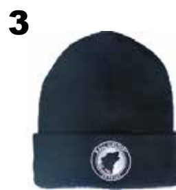
Fleece-Lined Beanie Price: $18.00