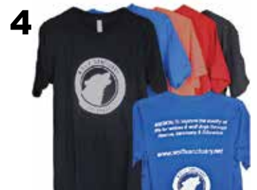
Logo Unisex Short Sleeve T Sizes: S - 2XL Price: $17.00